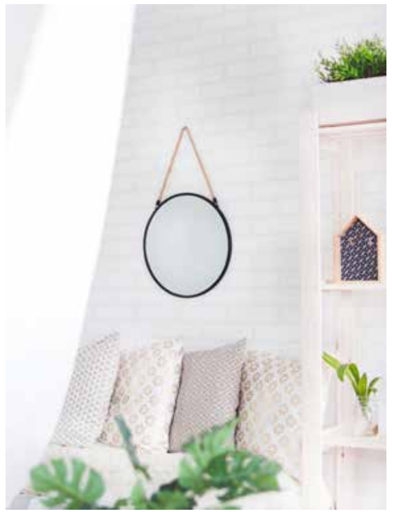
Fifty Seven Promenade gives you the choices without the compromise. Your own dwelling space, a safe space from the demanding urban environment.