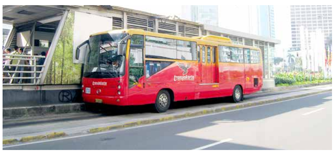
For reference only.

Everyone dreams of borderless world of their own. Located near to the iconic Plaza Indonesia and Grand Indonesia, Fifty Seven Promenade definitely screams 'walkability' to all the coolest place and vital facilities of Jakarta.