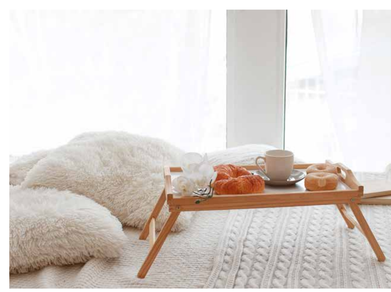
For reference only

The terms 'a room of one's own' has gained accolades as one of the world's most important